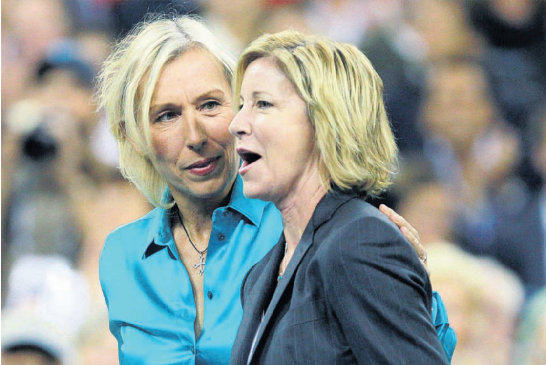
Former tennis players Martina Navratilova, left, and Chris Evert are introduced before the start of the women's championship match at the U.S. Open tennis tournament in New York, Saturday, Sept. 11, 2010.